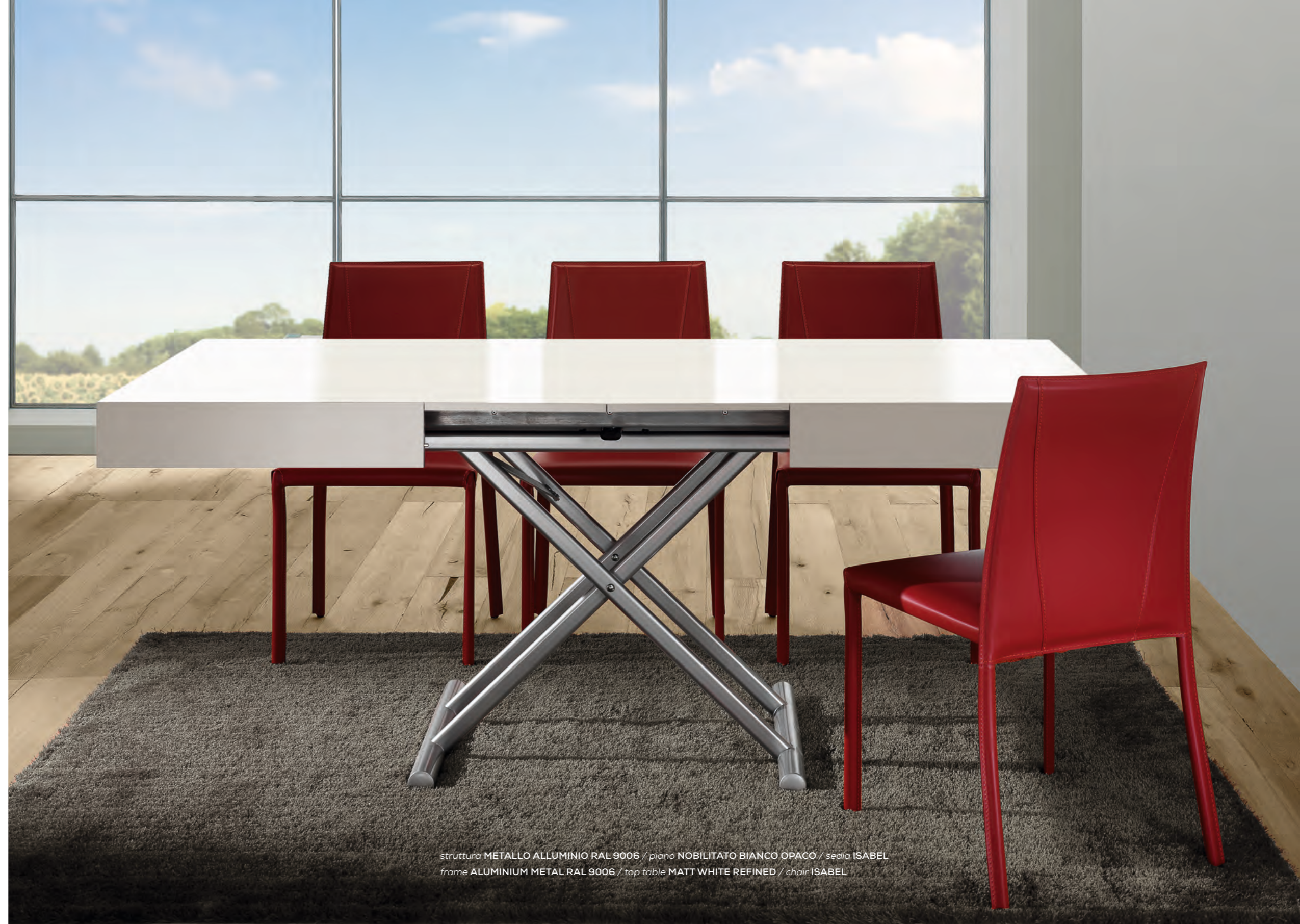
struttura METALLO ALLUMINIO RAL 9006 / piano NOBILITATO BIANCO OPACO / sedia ISABEL frame ALUMINIUM METAL RAL 9006 / top table MATT WHITE REFINED / chair ISABEL